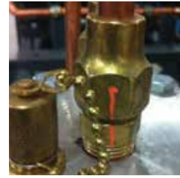
A torqued mechanical connection.