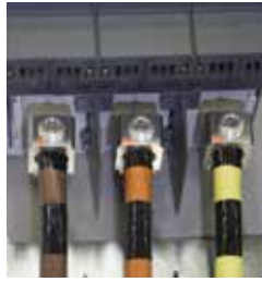
A torqued electrical connection.

Torque Control keeps electrical and mechanical connections compliant with manufacturers' recommended settings. A simple day-glow orange mark helps keep track of torqued connections.