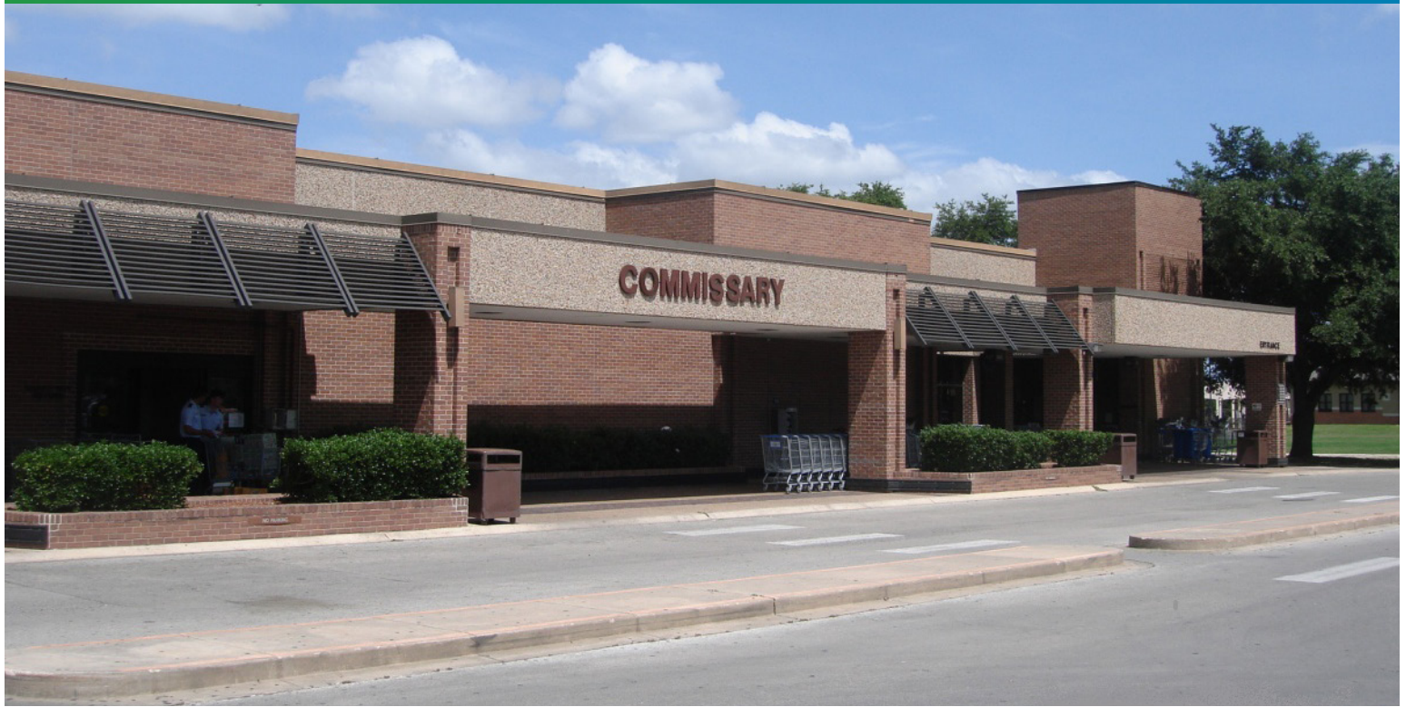
Outside the Lackland commissary.