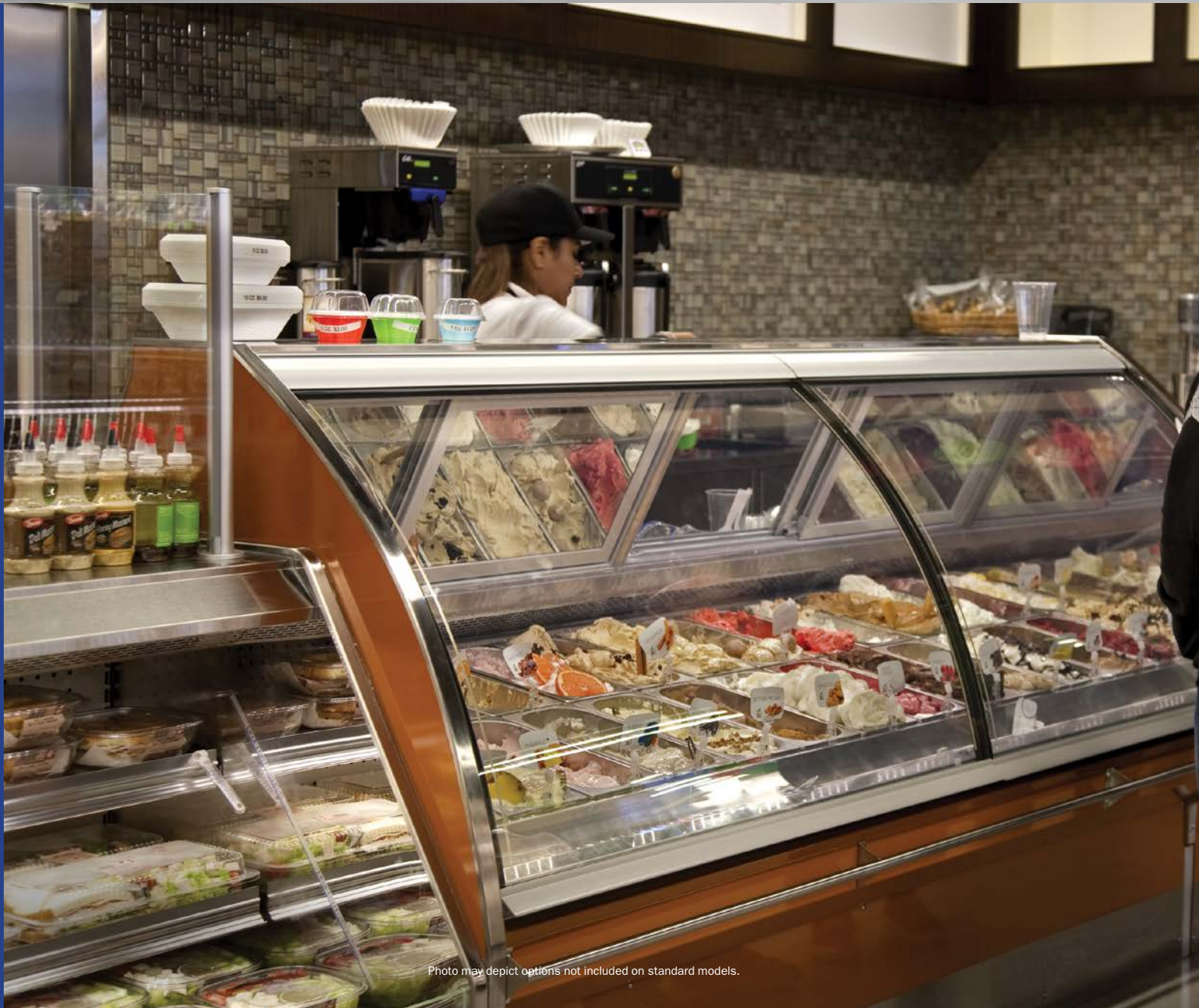
Photo may depict options not included on standard models.

Low temp refrigerated gelato merchandiser with curved or flat fixed glass.