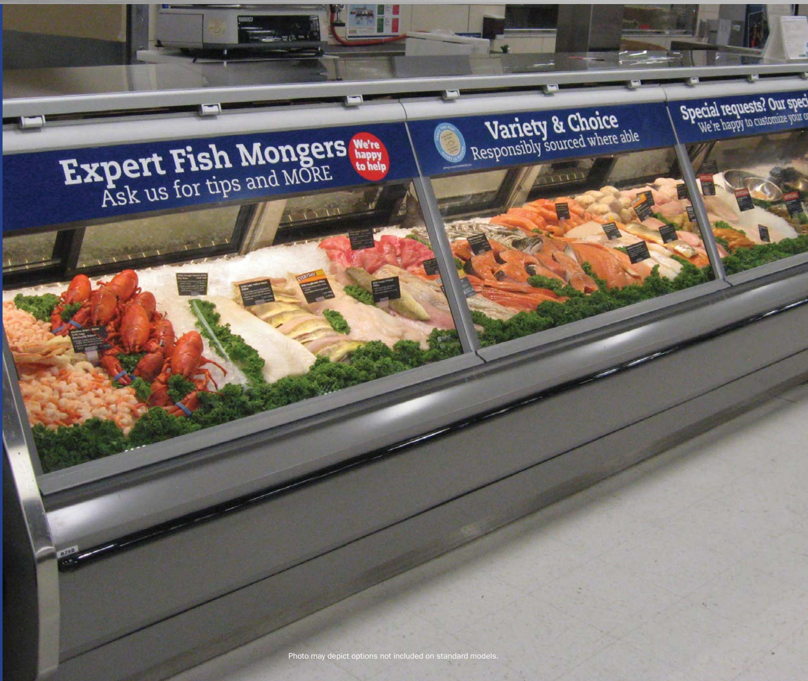
Photo may depict options not included on standard models.

Refrigerated gravity coil merchandiser for meat and seafood with flat lift-glass.