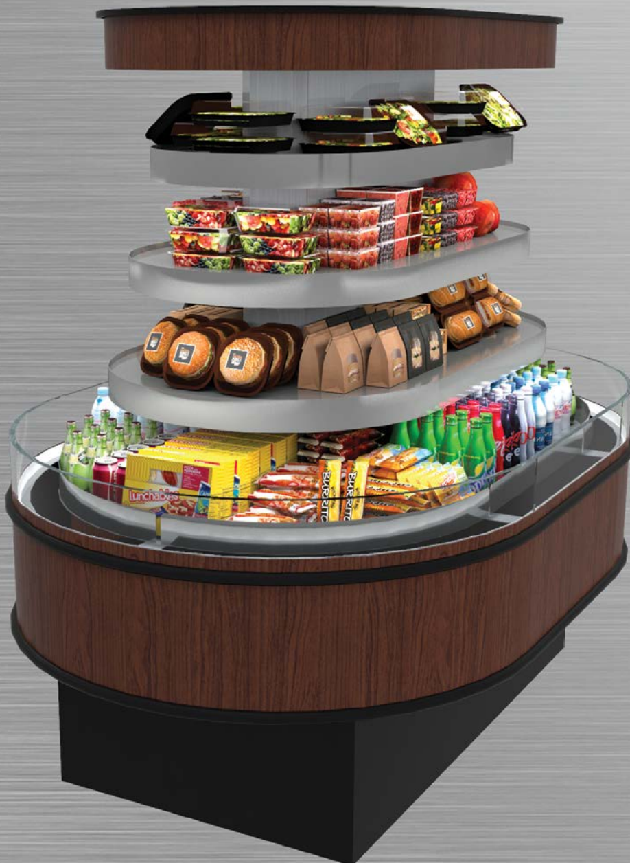
Photo may depict options not included on standard models.

Refrigerated island merchandiser for bakery, beverage, dairy, deli and produce.