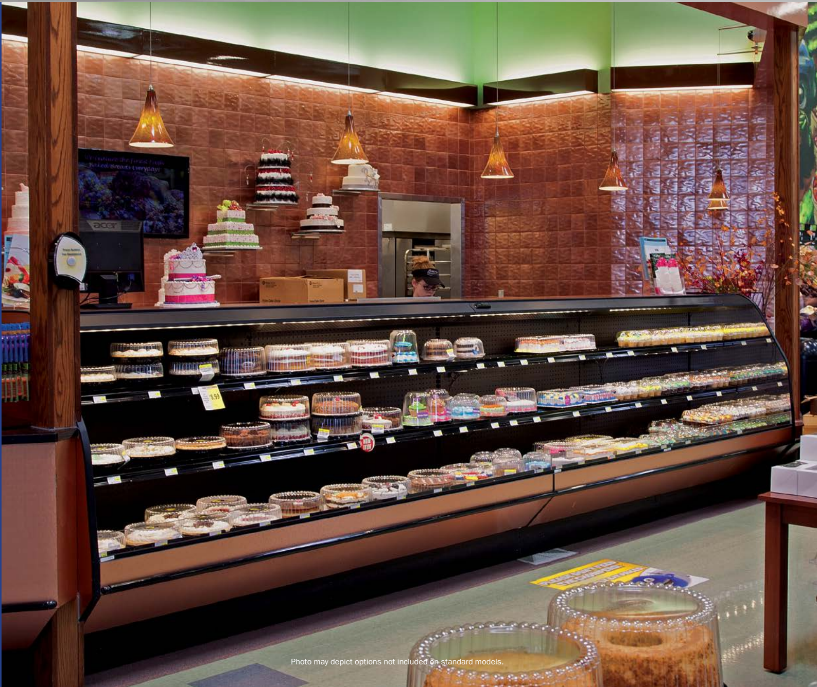
Photo may depict options not included on standard models.