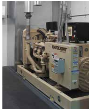
Get the added security of a back up generator built in to your center.

Ask your Hillphoenix representative as to how you can utilize a combination center in your next project.