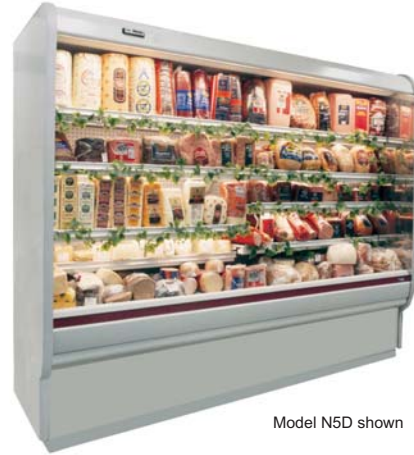
Model N5D shown

The N5D series narrow multi-deck merchandiser provides a narrow depth footprint, when space in aisles and behind service cases is a premium. These remote cases are great for displaying dairy, deli and beverages. This case is also available in a self-contained model, the N5DSC (see the following page).