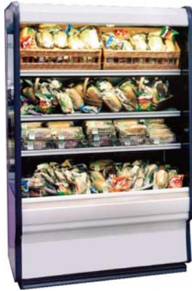
Model N5DSC4 shown