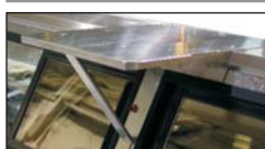
Scale Shelves add more functionality to the work area.