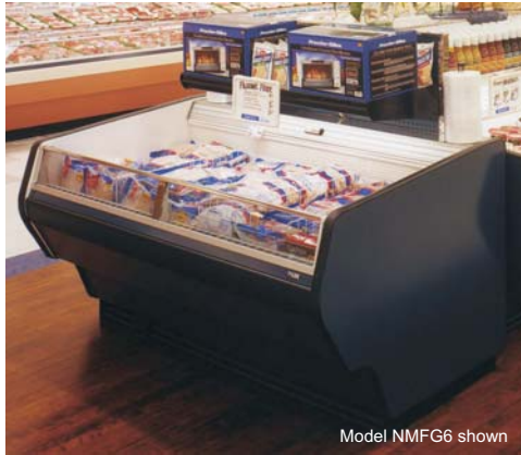
Model NMFG6 shown