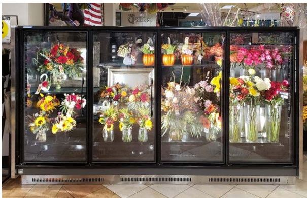
VNRBS case configuration with (2) 18" deep shelves is intended for non-critical temperature floral applications only.

Please consult Hillphoenix Engineering Reference Manual for dimensions, plan views and technical specifications. Specifications subject to change without notice. Designed for optimal performance in store environments where temperature and humidity do not exceed 75° F and 55% R.H. Certified to UL 471 and ANSI/NSF Standard 7.